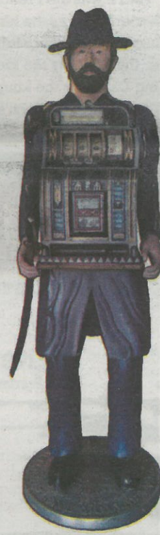
A Mills 5 Cent slot machine in the likeness of Ulysses S. Grant made $2,640. This astonishingly realistic figure was 72" tall.

• Lot #428, a complete set of 50 Superman Primrose Confectionery trading cards from 1967 scored $960 on its $100-150 estimate. This crisp